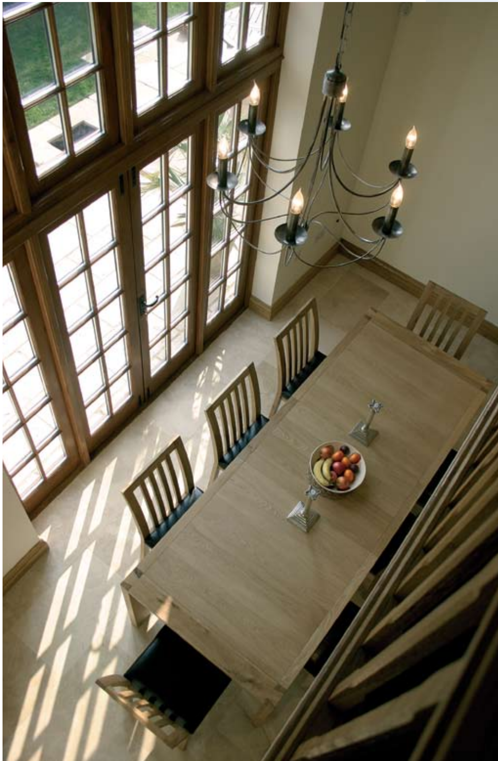
Dining room viewed from gallery showing the fine oak joinery featured throughout the development.